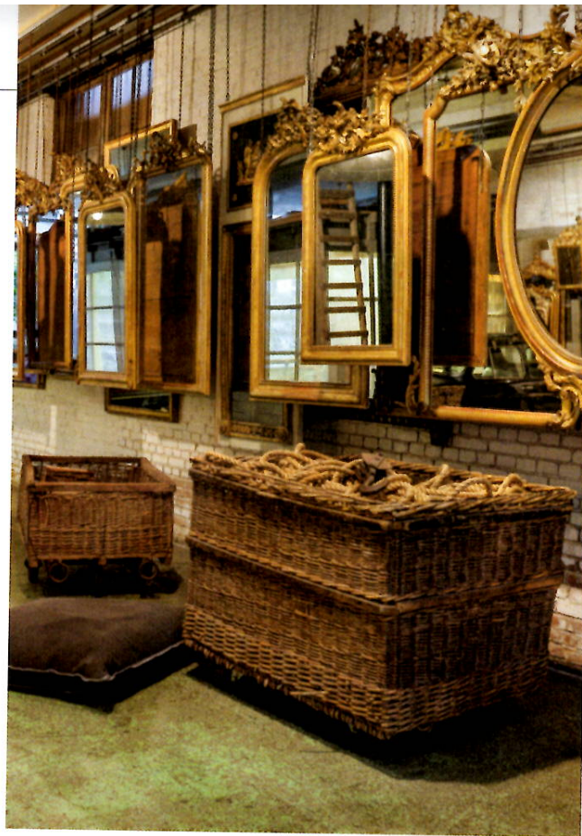
Clockwise from far left: Collected vignettes like this one are plentiful at Monique Relander's shoppable home. Anouk Beerents' charming shop in Amsterdam features a bevy of gilded mirrors. Truly unique finds are around every corner at Espace Nord Ouest. An antique clock at Lorforde's Antiques.