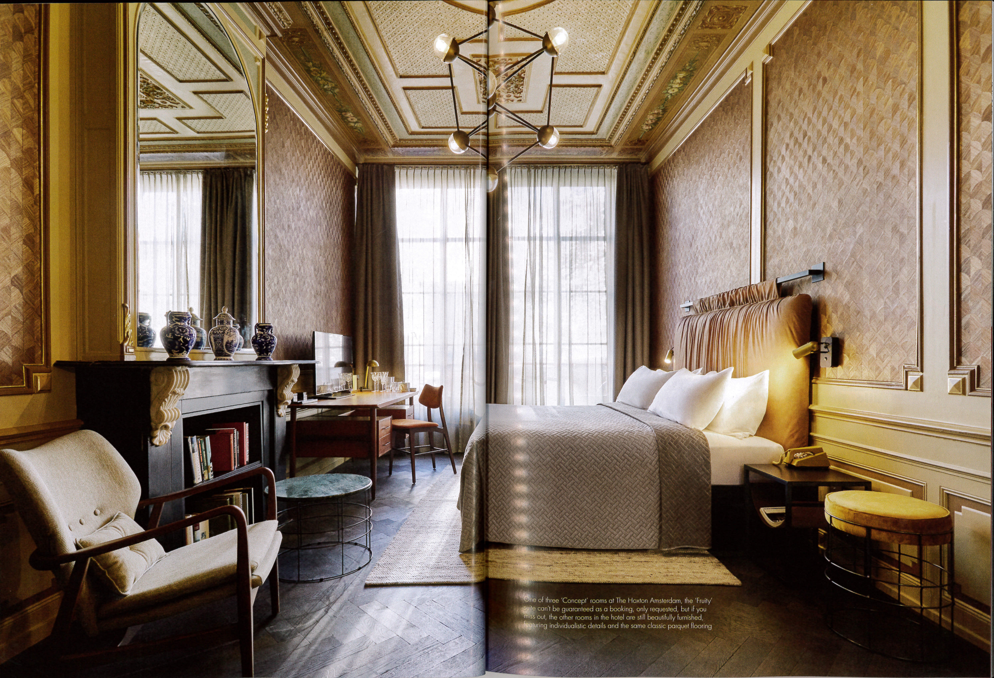
One of three 'Concept' rooms at The Hoxton Amsterdam, the 'Fruity' suite can't be guaranteed as a booking, only requested, but if you miss out, the other rooms in the hotel are still beautifully furnished, featuring individualistic details and the same classic parquet flooring